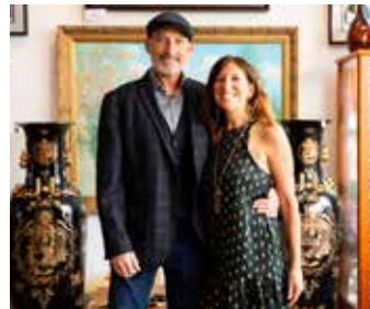
Locally Owned • Trusted Neighbors

That jewelry you haven't worn in years may be worth WAY more than you think!