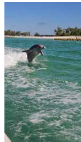
this months cover photo