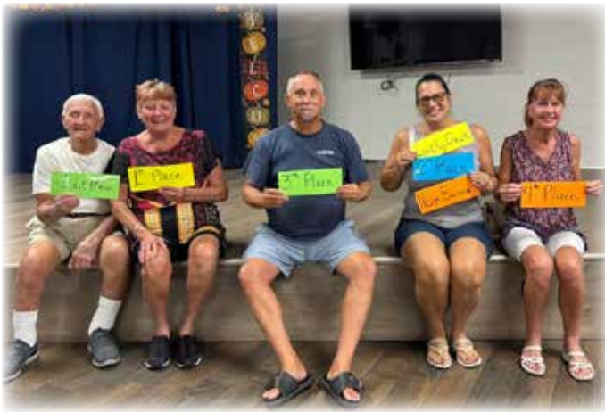
BUNCO WINNERS NOV 2025